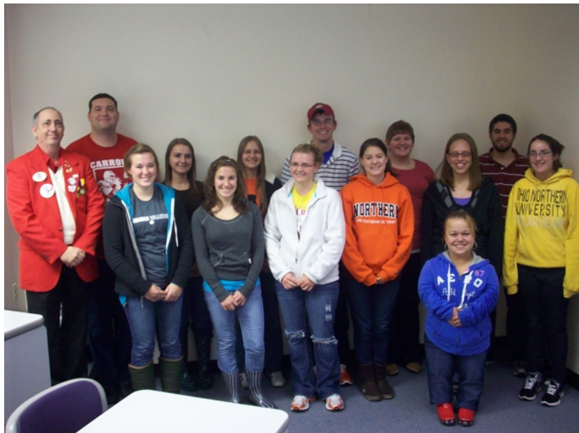
The Lions inducted into the ONU Campus Lions Club in September and October.